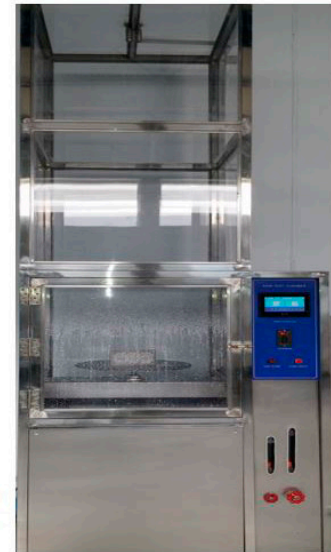
Testing under water jet