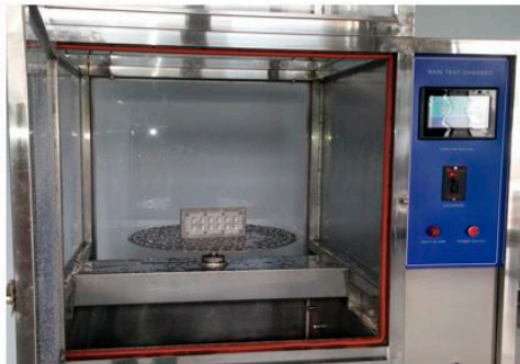
Testing under water jet