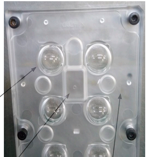
1st impact test