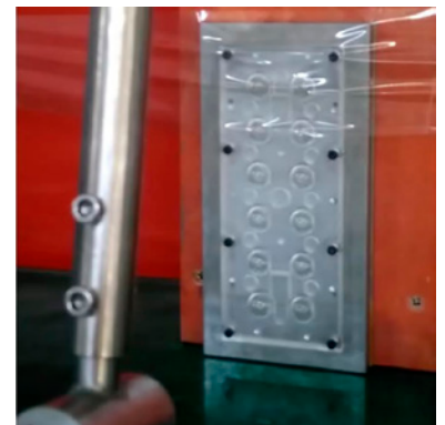
3 rd TEST