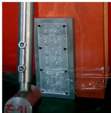
2 nd TEST